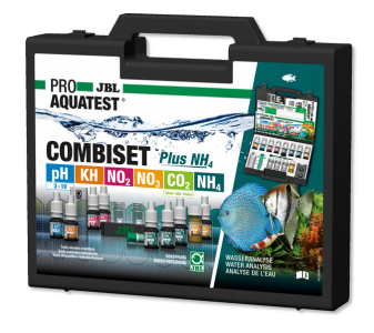
JBL PROAQUATEST COMBISET Plus NH4 Test case with most important