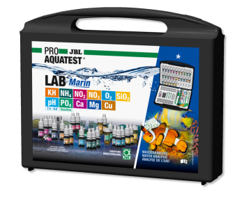
JBL PROAQUATEST LAB Marin

Professional test case for marine water analysis