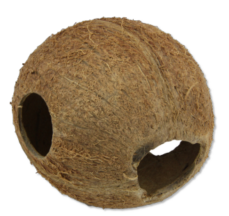
JBL Cocos Cava Coconut cave for aquariums and terrariums