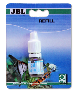
JBL pH Test 7.4-9.0 pH test in aquariums and ponds in the range 7.4-9.0