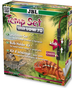
JBL TempSet Unit L-U-W Installation kit for metal-halide lamps