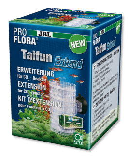
JBL PROFLORA Taifun Extend Extension for CO2 high-performance diffuser