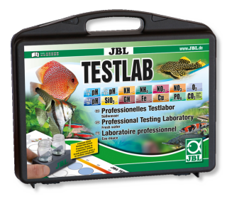
JBL Testlab Test case with 13 tests f. freshwater analysis Testlab

Test case with most important water tests + iron test