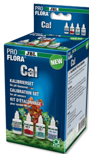
JBL PROFLORA Cal Complete kit for calibration