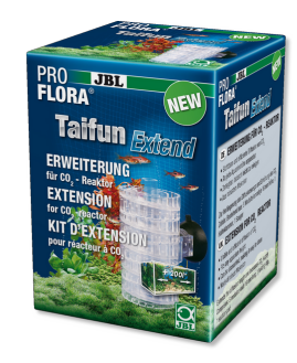
JBL PROFLORA Taifun Extend Extension for CO2 highperformance diffuser