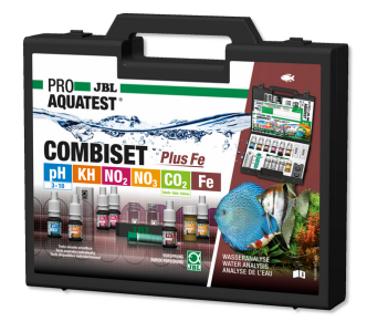
JBL PROAQUATEST COMBISET Plus Fe Test case with most important water tests + iron test