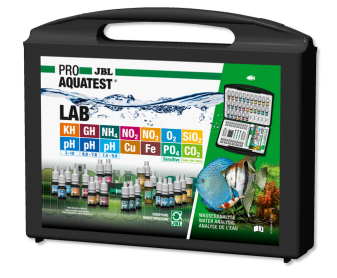
JBL PROAQUATEST LAB Test case with 13 water tests for freshwater analysis