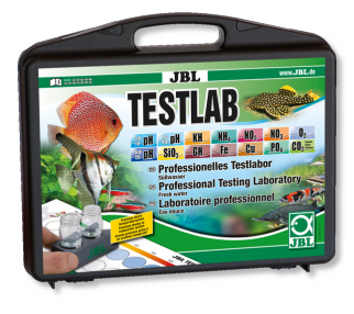
JBL Testlab Test case with 13 tests f. freshwater analysis Testlab

Test case with most important water tests + iron test