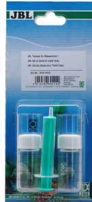
JBL component set for water tests