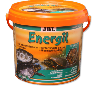
JBL Energil Main food for turtles and pond terrapins