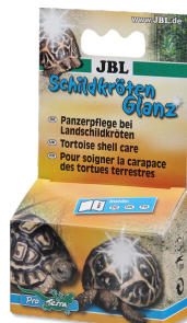
JBL Turtle Sun Glanz Shell care for tortoises