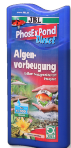
JBL PhosEX Pond Direct Phosphate remover for ponds