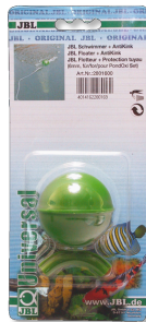
JBL Floater + AntiKink Floater with anti-kink protection for PondOxi-Set