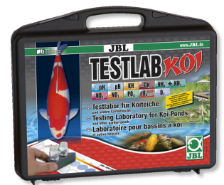
JBL Testlab Koi Professional test case for koi and garden ponds