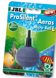
JBL ProSilent Aeras Micro Ball L Air stone for fine air bubbles