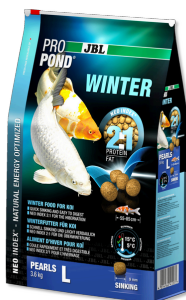
JBL PROPOND WINTER L Winter food for large koi