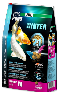
JBL PROPOND WINTER M Winter food for medium-sized koi