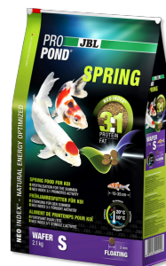
JBL PROPOND SPRING S Spring food for small koi