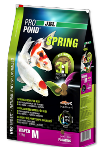
JBL PROPOND SPRING M Spring food for medium-sized koi