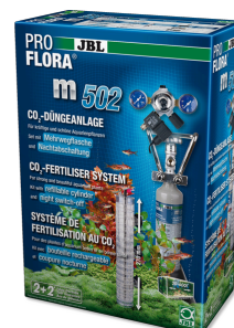
JBL PROFLORA m502 CO2 plant fertiliser system with night switch-off