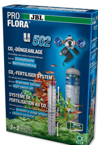
JBL PROFLORA u502 Plant fertiliser system with night switch-off