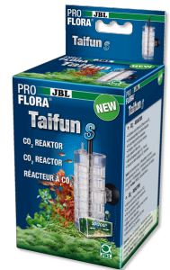
JBL PROFLORA Taifun S Extendable CO2 diffuser for small aquariums