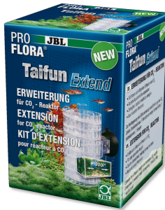
JBL PROFLORA Taifun Extend Extension for CO2 high-performance diffuser