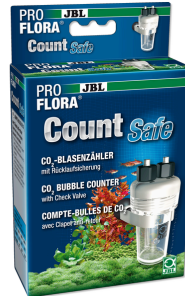
JBL PROFLORA CO2 Count Safe Bubble counter with backflow stop