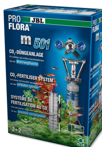
JBL PROFLORA m501 CO2 plant fertiliser system complete kit