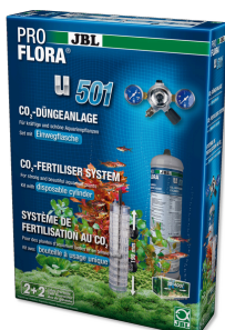
JBL PROFLORA u501 Plant fertiliser system complete kit