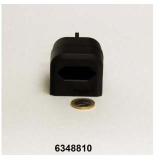
JBL adapter UK for all flat-pin plugs