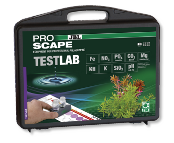
JBL Testlab ProScape Test case for water analysis in plant aquariums