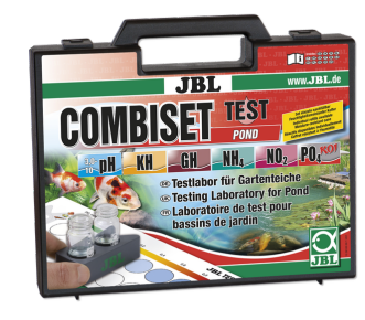
JBL Test Combi Set Pond

The most important water tests for garden ponds