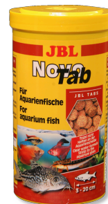
JBL NovoTab Main food tablets for all aquarium fish