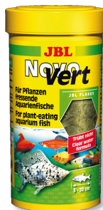
JBL NovoVert Main food flakes for plant-eating fish