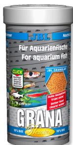
JBL Grana Premium main food granulate for small aquarium fish