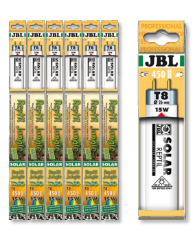
JBL SOLAR REPTIL JUNGLE T8 R torrarium fluoroscopt tu

T8 terrarium fluorescent tube for rainforest animals