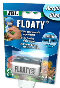
JBL FLOATY acrylic/ glass Floating acrylic pane cleaning magnet