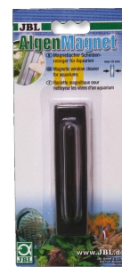
JBL Algae Magnet Magnetic glass cleaner for aquarium panes