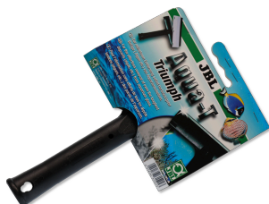
JBL Aqua-T Triumph Glass pane cleaner with spare blades and rubber scraper