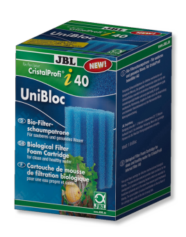
JBL CP i40/TekAir UniBloc blue Foam cartridge for Cristal Profi i40 and TekAir