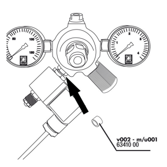
JBL ProFlora "u/m" flat seal