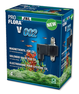
JBL PROFLORA v002 Noiseless solenoid valve