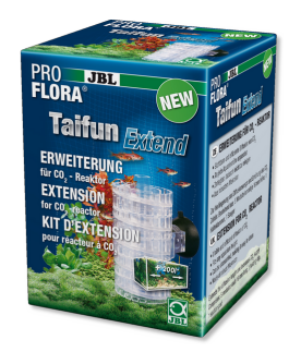
JBL PROFLORA Taifun Extend Extension for CO2 highperformance diffuser