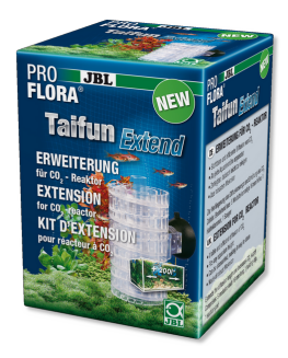
JBL PROFLORA Taifun Extend Extension for CO2 highperformance diffuser