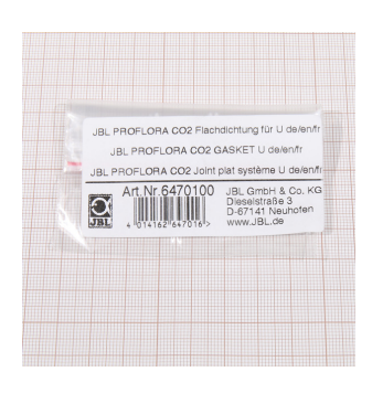
JBL PF CO2 flat gasket for u