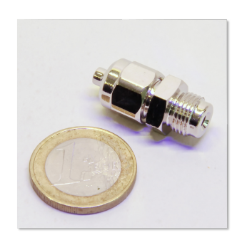
JBL tube screw connection 4/6 pressure reducer