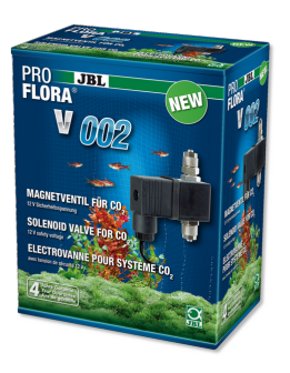
JBL PROFLORA v002 Noiseless solenoid valve