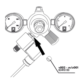
JBL ProFlora "u/m" flat seal