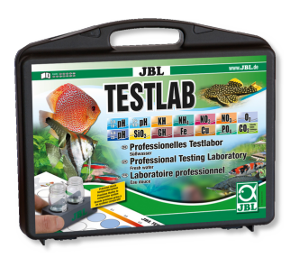
JBL Testlab Test case with 13 tests f. freshwater analysis Testlab

Test case with most important water tests + iron test