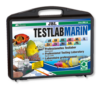
JBL Testlab Marin Professional test case for the analysis of saltwater