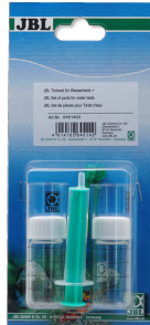
JBL component set for water tests