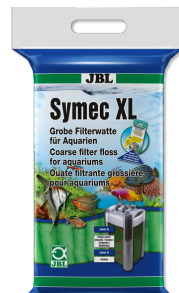
JBL Symec XL Coarse filter wool to remove all types of water cloudiness