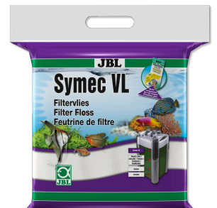
JBL Symec VL Filter wool fleece to remove water cloudiness