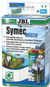
JBL Symec micro Microfibre fleece against water cloudiness