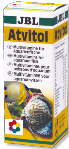
JBL Atvitol Multivitamin drops for aquarium fish