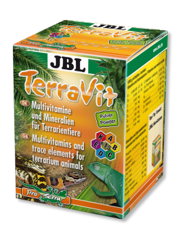
JBL TerraVit Powder Vitamins and trace elements for terrarium animals