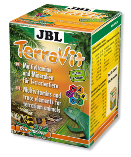
JBL TerraVit Powder Vitamins and trace elements for terrarium animals