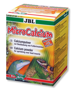
JBL MicroCalcium Mineral supplementary food for all reptiles