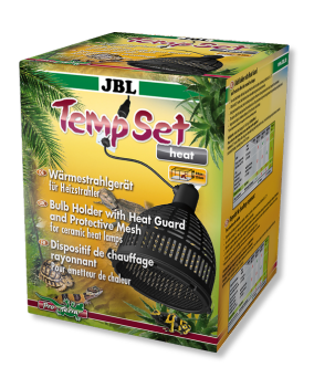
JBL TempSet Heat Install. kit with ceramic bulb holder for heat radiator