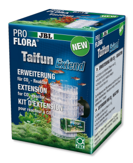
JBL PROFLORA Taifun Extend Extension for CO2 highperformance diffuser