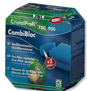
JBL CombiBloc CristalProfi e Pre-filter pads and filter foam for CristalProfi e