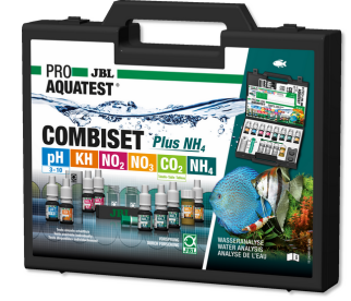
JBL PROAQUATEST COMBISET Plus NH4 Test case with most important water tests + NH4 test