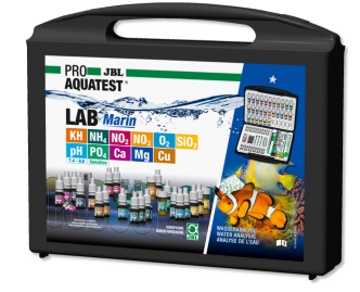
JBL PROAQUATEST LAB Marin Professional test case for marine water analysis