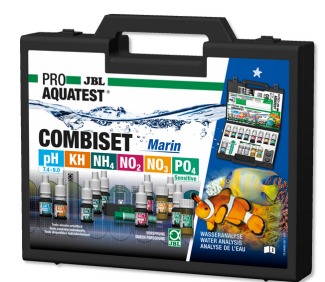
JBL PROAQUATEST COMBISET Marin Test case for water analyses in marine aquariums