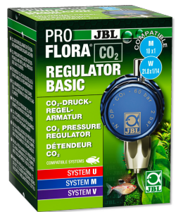
JBL PROFLORA CO2 REGULATOR BASIC Press. regulator for CO2 aquarium plant fertil. system