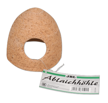
JBL Ceramic spawning cave Ceramic cave for freshwater aquariums