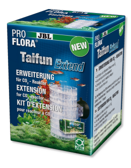
JBL PROFLORA Taifun Extend Extension for CO2 highperformance diffuser