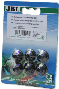
JBL slotted suction cup, 2mm

Holder for heating cables in aquariums and terrariums