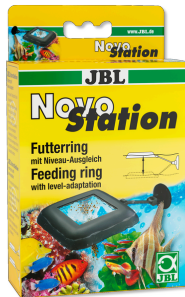
JBL NovoStation Floating feeding ring with water level adaption