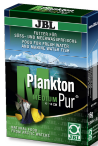
JBL PlanktonPur MEDIUM