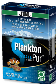
JBL PlanktonPur SMALL