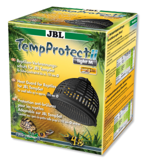
JBL TempProtect II light Reptile thermal burn protection for JBL TempSet items