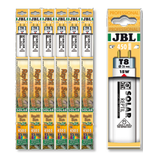
JBL SOLAR REPTIL SUN Т8 Special T8 terrarium fluoresc. tube for desert animals