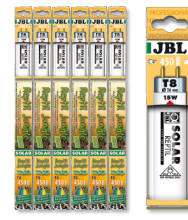
JBL SOLAR REPTIL JUNGLE T8 T8 terrarium fluorescent tube for rainforest animals