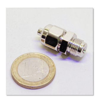
JBL tube screw connection 4/6 pressure reducer