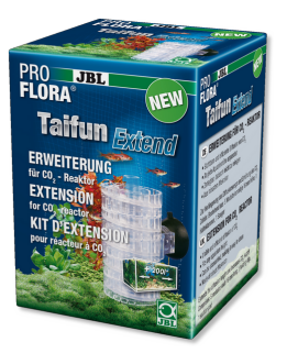
JBL PROFLORA Taifun Extend Extension for CO2 highperformance diffuser