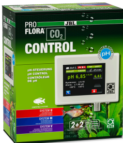
JBL PROFLORA CO2 CONTROL Measurement and control computer to regulate CO2 & pH