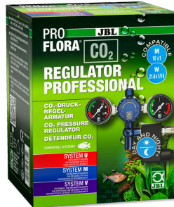
JBL PROFLORA CO2 REGULATOR PROFESSIONAL Pressure regulator with 2 displays & valve for CO2