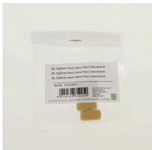
JBL DigiScan Alarm Velcro Pad, 2 sets