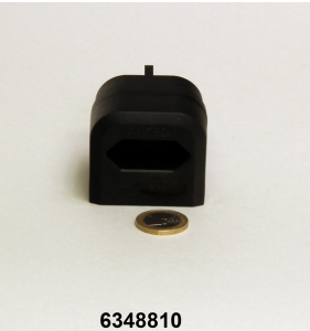
JBL adapter UK for all flat-pin plugs