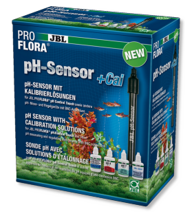
JBL PROFLORA pH-Sensor+Cal pH electrode with BNC connection