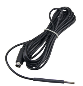
JBL pH Control temperature sensor