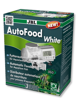
JBL AutoFood WHITE White automatic feeder for aquarium fish