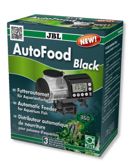
JBL AutoFood BLACK Black automatic feeder for aquarium fish