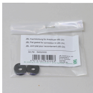
ProFlora u95 flat gasket