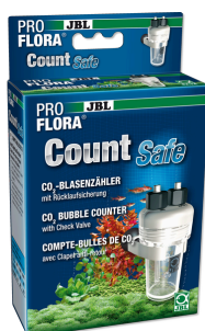
JBL PROFLORA CO2 Count Safe