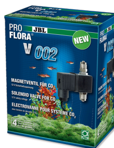
JBL PROFLORA v002

Fitting to reduce pressure for 2 CO2 diffusers