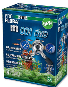
JBL PROFLORA m001 duo

Fitting to reduce pressure for 2 CO2 diffusers