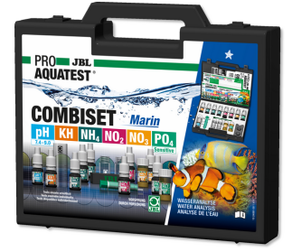
JBL PROAQUATEST COMBISET Marin

Test case for water analyses in marine aquariums