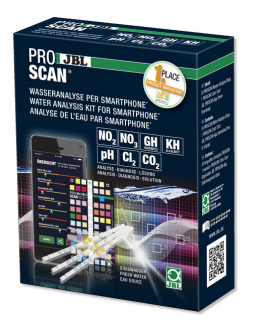
JBL PROSCAN Water test with analysis via smartphone